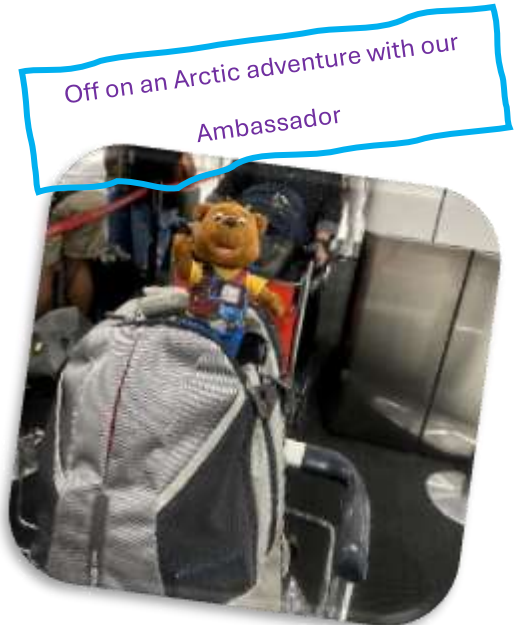
Off on an Arctic adventure with our Ambassador