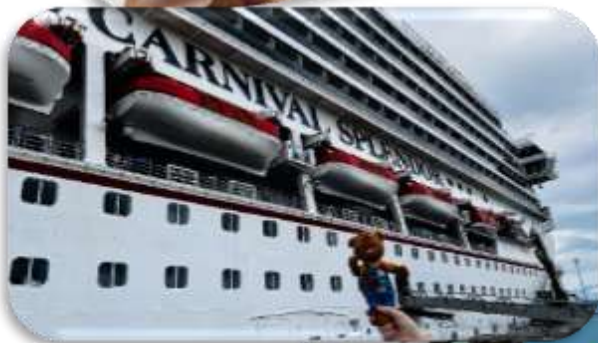
Hanging out with some friends on a Cruise to NZ with our Senior Vice President.