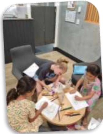
Liza in Tindal had a good turnout at a recent coffee catch up