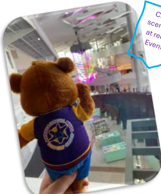
Checking out the scene at Questacon at recent Welcome Event in Canberra